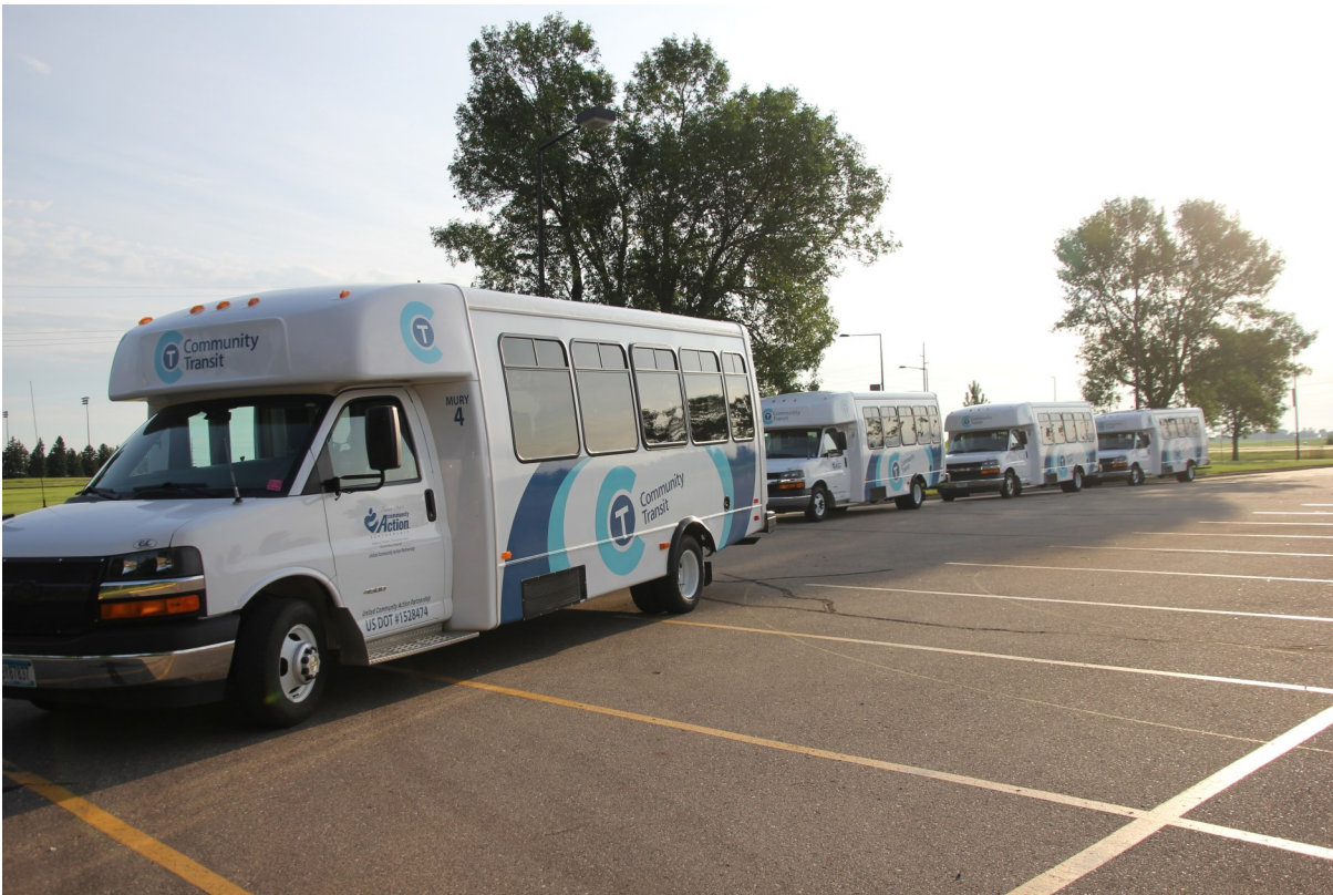
File Photo: MPTA Rodeo 2019