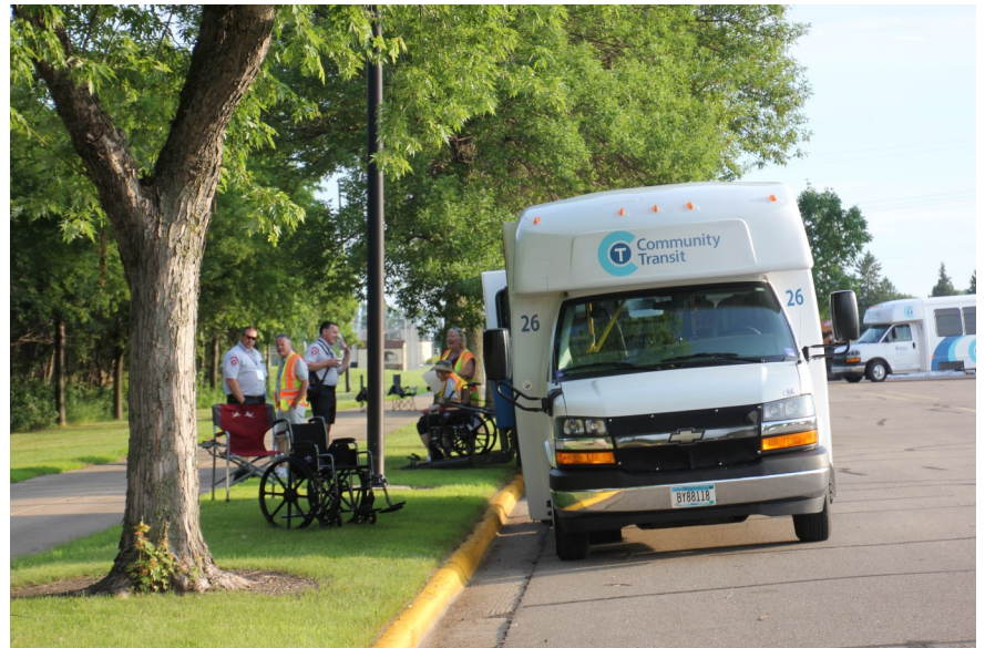
File Photo: Bus from 2019 MPTA Roadeo. MnDOT is seeking public comments on existing rules for Special Transportation Services providers

All new rule amendments, after implemented, will affect STS providers, drivers and attendants of special transportation service vehicles, clients of special transportation services, insurance companies that provide coverage for special transportation